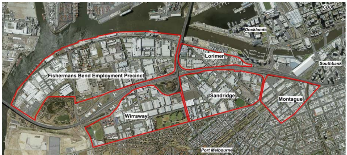
Figure 1 Fishermans Bend Precinct

The four precincts (Montague, Sandridge, Wirraway and Lorimer) that make up the Fishermans Bend Urban Renewal Area (FBURA) as well as the recently announced Fishermans Bend Employment Precinct are shown in Figure 1.